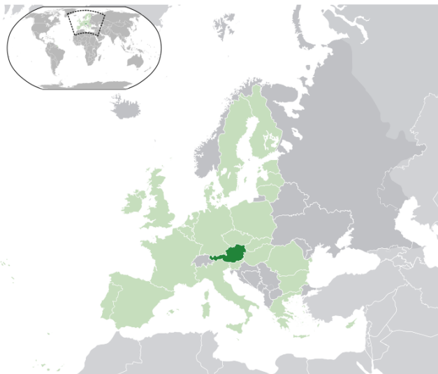
Figure 1 - Location of Austria

Austria, officially the Republic of Austria ('Republik Österreich') is a landlocked country of roughly 8.3 million people in Central Europe. It borders both Germany and the Czech Republic to the north, Slovakia and Hungary to the east, Slovenia and Italy to the south, and Switzerland and Liechtenstein to the west. The territory of Austria covers 83,872 km 2 (32,383 sq mi), and is influenced by a temperate and alpine climate. Austria's terrain is highly mountain-nous due to the presence of the Alps; only 32% of the country is below 500 meters (1,600 ft), and its highest point is 3,797 metres (12,460 ft).