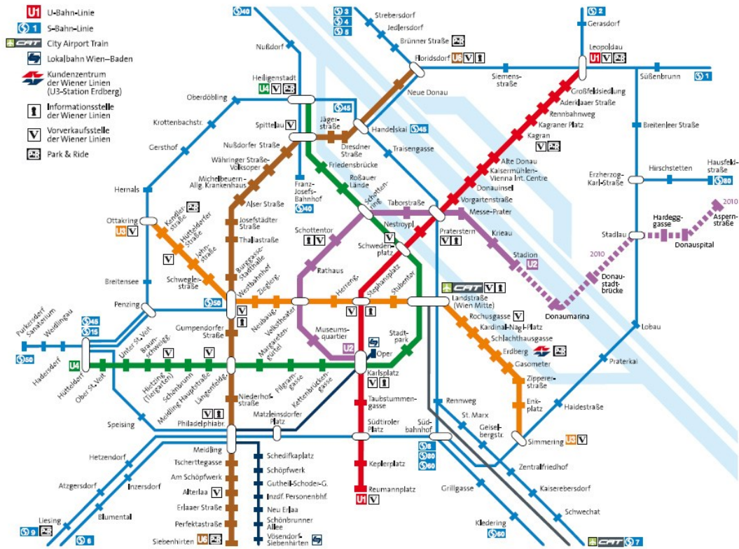
Figure 4 – Vienna Rapid Traffic System