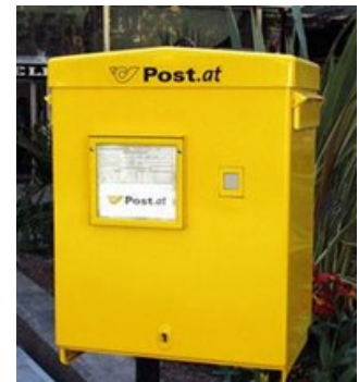
Figure 5 - Austrian letterboxes

Austrian letterboxes are yellow (see picture) and can be found on most streets. For details on how to send mail check www.post.at/en/114.php .